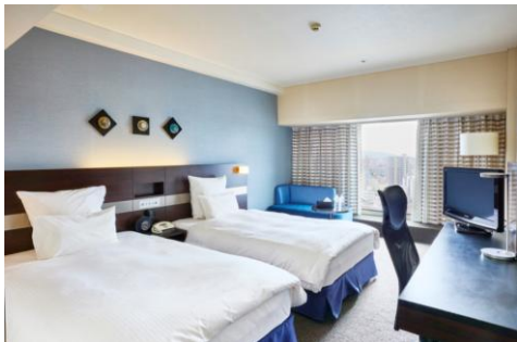
Standard Twin Non-smoking (27.1sqm) Bed size 120cm x 200cm

**Please note Room type will be assigned depending on hotel availability.