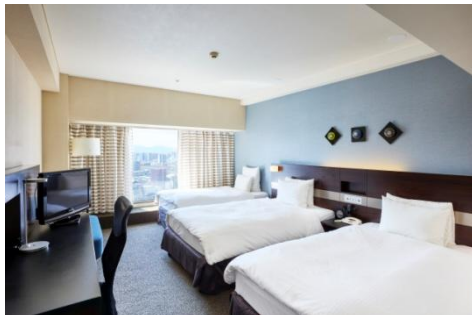
Standard Triple Non-smoking (27.1sqm) Bed size 120cm x 200cm *3 adults Only