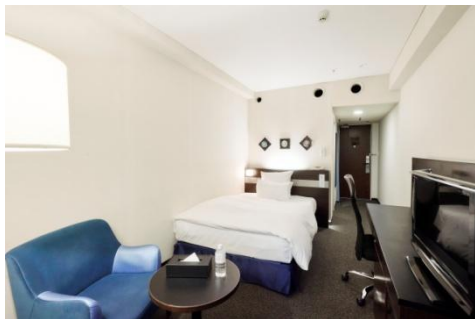
Standard Single Non-smoking (22.5sqm) Bed size 140cm x 200cm